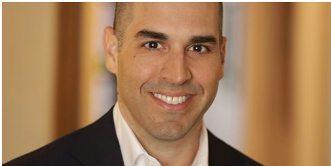
Dynasty loses its CIO and CTO