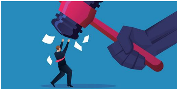
Fisher Investments fires advisor following Finra suspension