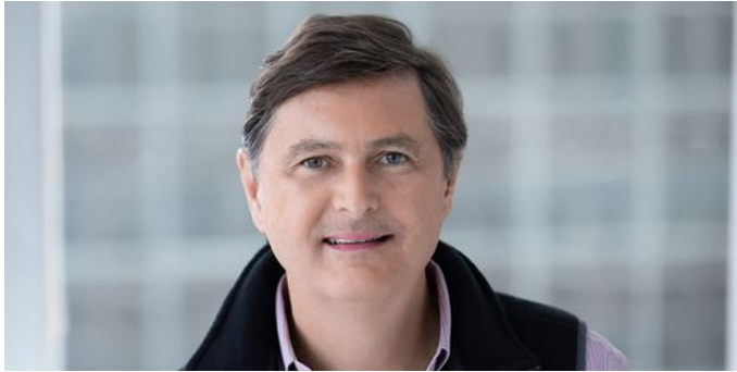
Focus adds $700m Florida RIA as partner firm