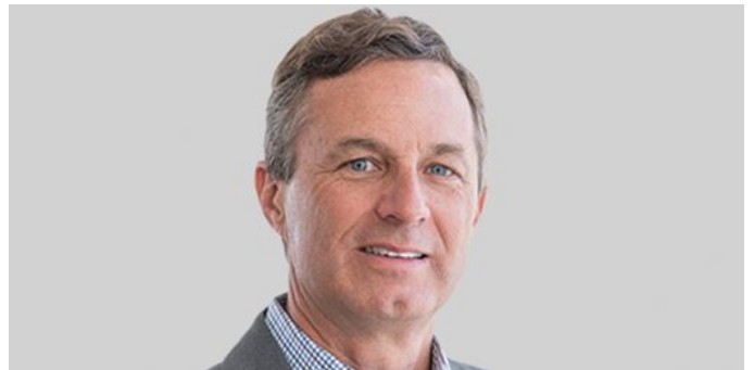
Wealth Enhancement Group buys $1.5bn Philly-area RIA